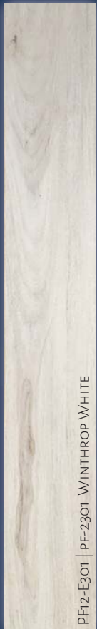
PF12-E301 | PF-2301 WINTHROP WHITE