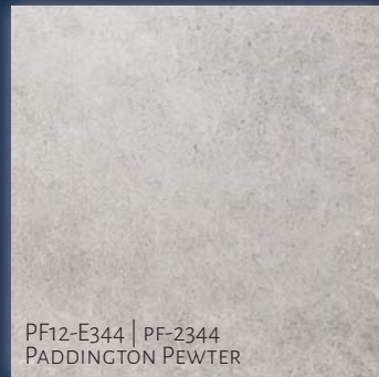
PF12-E344 | PF-2344 PADDINGTON PEWTER