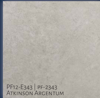
PF12-E343 | PF-2343 ATKINSON ARGENTUM