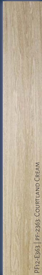
PF12-E363 | PF-2363 COURTLAND CREAM